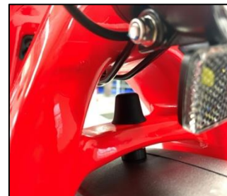
Upgraded attachment system

Cycling Sports Group Europe B.V. Hanzepoort 27 Oldenzaal, 7575DB tel 0541 20 05 87 option 1